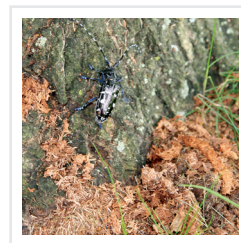
Sawdust-like material, called frass, near exit hole