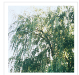
Yellowing or drooping leaves or dead branches