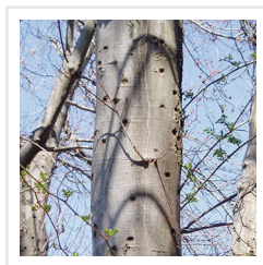
Trunk riddled with exit holes