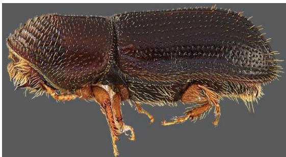
Figure 4. Walnut twig beetle, side view.

Description. The walnut twig beetle Pityophthorus juglandis is a minute (1.5-1.9 mm) yellowish-brown bark beetle, about 3X long as it is wide. It is the only Pityophthorus species associated with Juglans but can be readily distinguished from other members of the genus by several physical features (Figures 4, 5). Among these are 4 to 6 concentric rows of asperities on the prothorax, usually broken and overlapping at the median line. The declivity at the end of the wing covers is steep, very shallowly bisulcate, and at the apex it is generally flattened with small granules.