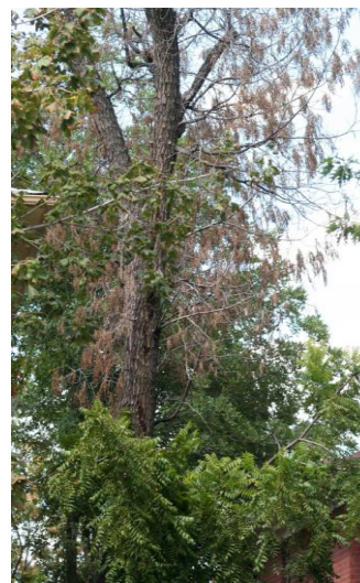
Figure 1. Rapidly wilting black walnut in the final stage of thousand cankers disease.

symptoms are noted. Tree mortality is the result of attack by the walnut twig beetle ( Pityophthorus juglandis ) and subsequent canker development around beetle galleries caused by a fungal associate ( Geosmithia sp.) of the beetle (Figure 2). The proposed name for this insect-disease complex is thousand cankers disease (TCD) of walnut.