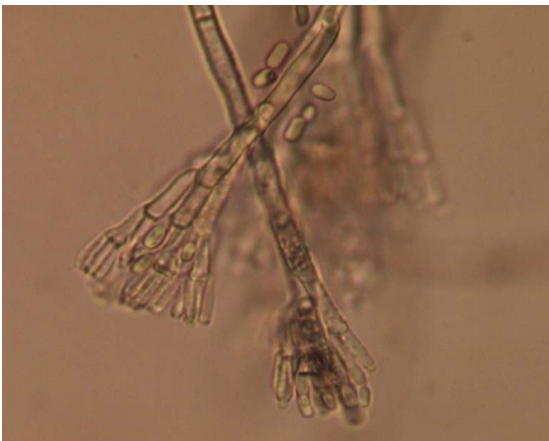
Figure 8. Conidiophores and conidia of Geosmithia .

Two different types of cankers have been observed on declining walnut trees. Small, diffuse, dark brown to black cankers, caused by an unnamed fungus in the genus Geosmithia , initially develop around the tunnels of the walnut twig beetle (Figure 8). (The proposed species name for this fungus is Geosmithia morbida .) The fungus has also been consistently cultured from beetles that emerge from black walnut.