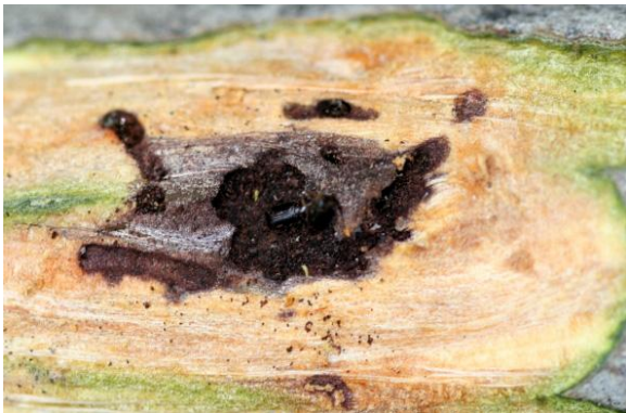
Figure 6. Walnut twig beetle and associated staining around tunnel.

Winter is spent primarily, and possibly exclusively, in the adult stage sheltered within cavities excavated in the bark of the trunk. Adults resume activity by late-April and most fly to branches to mate and initiate new tunnels for egg galleries; some may remain in the trunk and expand overwintering tunnels. During tunneling the Geosmithia fungus is introduced and subsequently grows in advance of the bark beetle (Figure 6). Larvae feed for 4-6 weeks under the bark in meandering tunnels that run perpendicular to the egg gallery (Figure 7) and pupate at the end of the tunnel.