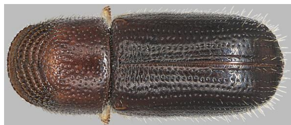
Figure 5. Walnut twig beetle, top view.