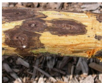
Figure 2. Coalescing branch cankers produced by Geosmithia . Note the whitish sporulation of Geosmithia in lower left gallery.

Within the past decade an unusual decline of black walnut ( Juglans nigra ) has been observed in several western states. Initial symptoms involve a yellowing and thinning of the upper crown, which progresses to include death of progressively larger branches (Figure 1). During the final stages large areas of foliage may rapidly wilt. Trees often are killed within three years after initial