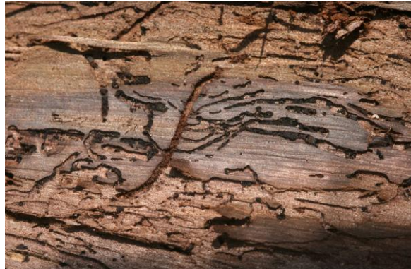
Figure 7. Walnut twig beetle tunneling under bark of large branch.

Adults emerge to produce a second generation in early summer. Peak flight activity of adults occurs from mid-July through late August and declines by early fall as the beetles enter hibernation sites. A small number of beetles produced from eggs laid late in the season may not complete development until November.