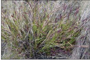
buffelgrass zacate buffel Pennisetum ciliare