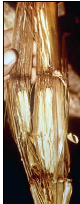
Figure 4. Dry hollow H. maydis infected stalk.

Stalk and root rots are, in general, the most serious and widespread group of diseases affecting corn growing regions of the world (Sabet et al., 1966b). Harpophora maydis causes a severe stalkrot. In Egypt, 90% of the plants of susceptible cultivars may be infected. Yield losses of up to 40% have been reported (Jain et al., 1974; El-Shafey and