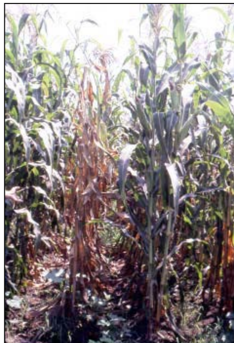
Figure 1. Rapid wilting of infected plant alongside resistant hybrids.

H. maydis can remain viable in the soil for several years in the absence of a host. H. maydis has been shown to persist on corn stubble for 12-15 months (Sabet et al., 1970b; Singh and Siradhana, 1987b). Inoculum survival in soil is generally poor and restricted to the top 20 cm of soil. Although it is a weakly competitive saprophyte (Sabet