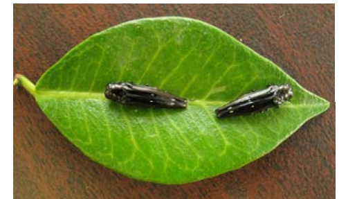
Adults of A. prionurus (note 4 white spots)