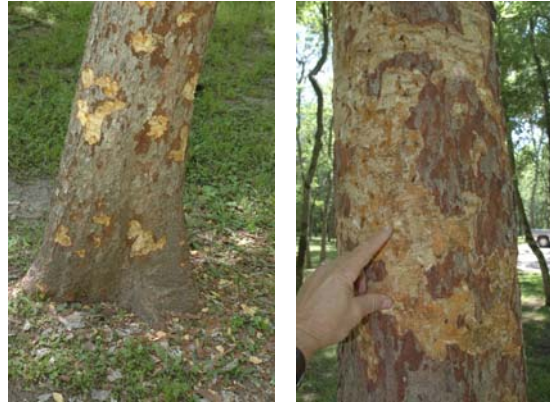
Characteristic symptoms of A. prionurus infestations

Western soapberry appears to be this insect's sole host in Texas and the tree exhibits little resistance to this introduced pest. Little else is known about the insect's biology or methods of control. For more information or to report new infestations, contact the authors: rbillings@tfs.tamu.edu or jpase@tfs.tamu.edu .