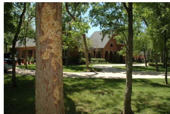
Desirable landscape soapberry tree killed near Houston